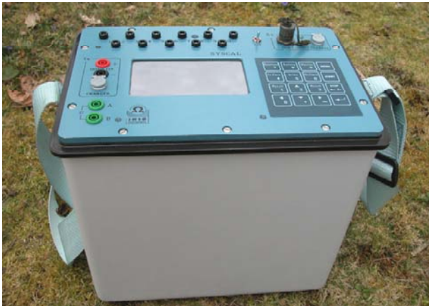
SYSCAL Pro unit